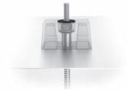
Quick Rack's superior waterproofing technology

The Quick Rack system features superior waterproofing technology with Quick Mount PV's patented elevated water seal. This ensures long-term water seal integrity and waterproofing for the life of the roof and solar array.